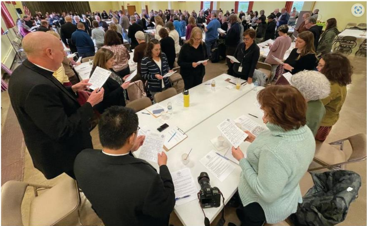
Diocesan and parish staff take part in a regional gathering for the Eucharistic Revival in the Diocese Oct. 17 at St. Bruno Parish, Greensburg »